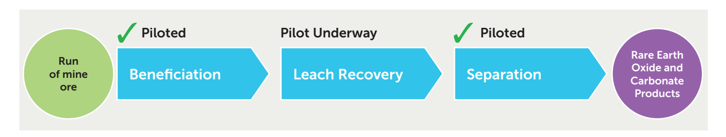
Figure 1: Three stage process developed by Peak for Nqualla's rare earth mineralisation and pilot plant status.

The operation of this final pilot plant (Figure 1) will complete the demonstration of the three stage process flowsheet that takes Ngualla's unique bastnasite mineralisation through to high purity separated rare earth products. The operation will provide vital operating and design parameters for incorporating into the Bankable Feasibility Study.