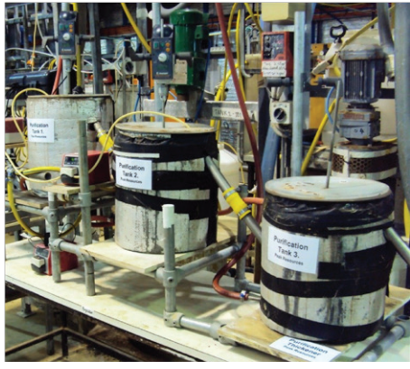
Figures 4 and 5: Leach and Purification sections of the Pilot Plant at ANSTO

In addition to demonstrating the robustness of the developed flowsheet at pilot scale on a continuous basis, valuable design data will be obtained for engineering and supply of vendor packages for the BFS.