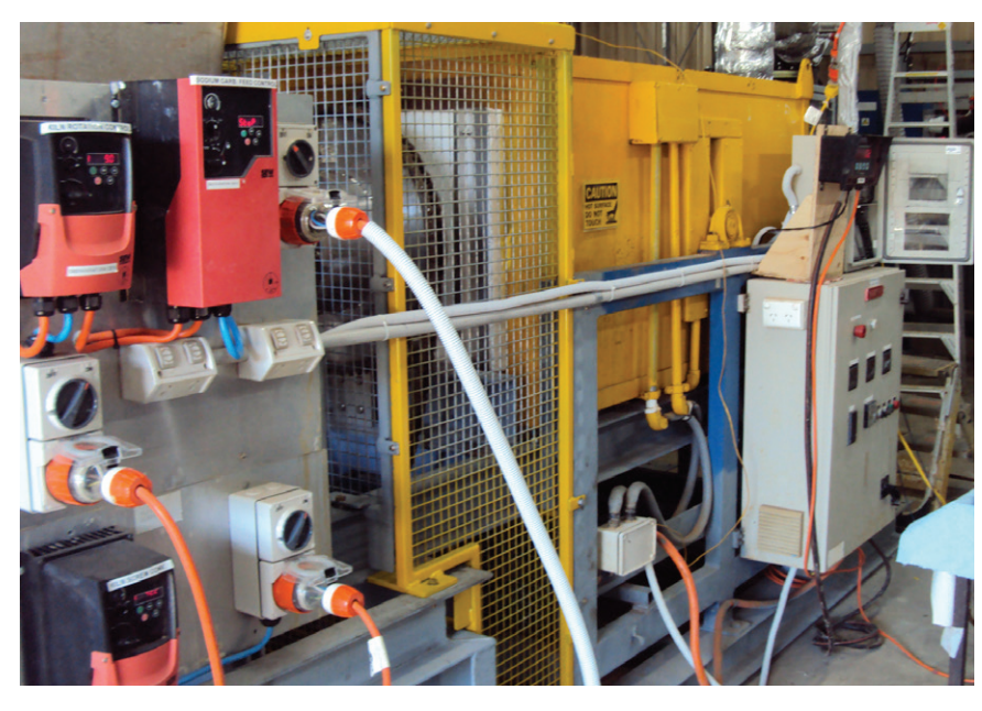
Figure 2: Rotary kiln section of Leach Recovery Pilot Plant at ANSTO's test facility.

The pilot plant will demonstrate the new selective leach flowsheet developed by Peak, a flowsheet that is a significant improvement on the previous Preliminary Feasibility Study (PFS) process.